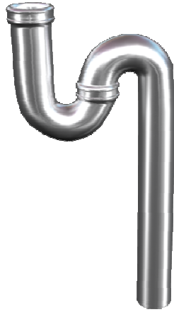
100mm "S" trap

MODEL NO: SST PRODUCT CODE: ST0050 / ST0100