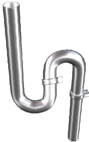
50mm "S" trap