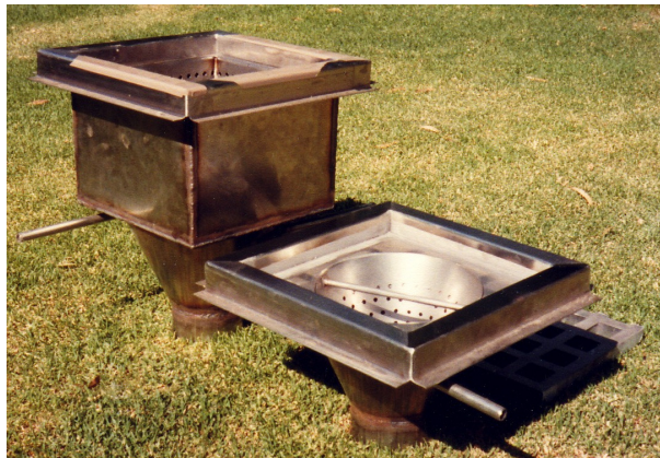
TYPE A—EXTENDED SUMP

* Nominate flushing or non-flushing type