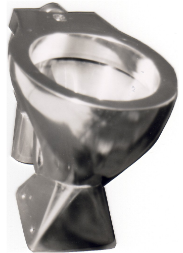
OPTIONAL EXTRA TOILET SEAT